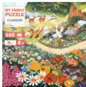
My Family Puzzle - Flowers