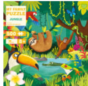
My Family Puzzle - Jungle