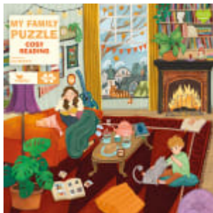
My Family Puzzle - Cosy Reading