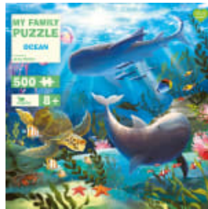
My Family Puzzle - Ocean