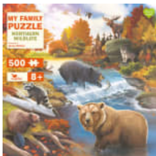
My Family Puzzle - Northern Wildlife