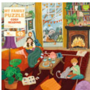
My Family Puzzle - Cosy Reading