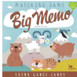
Big Memo - Mountains