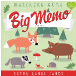
Big Memo - Forest